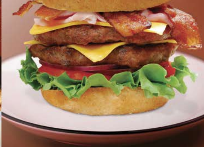
THE BEAST BURGER