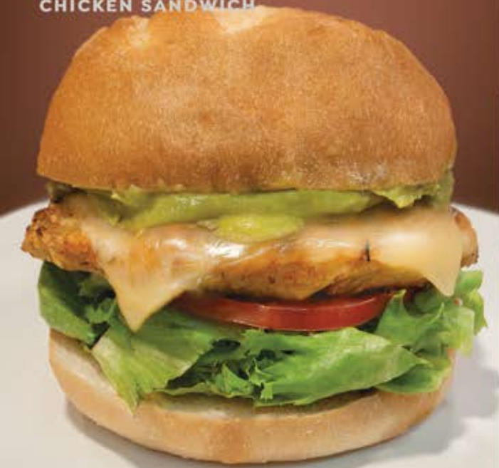
CALIFORNIA GRILLED CHICKEN SANDWICH