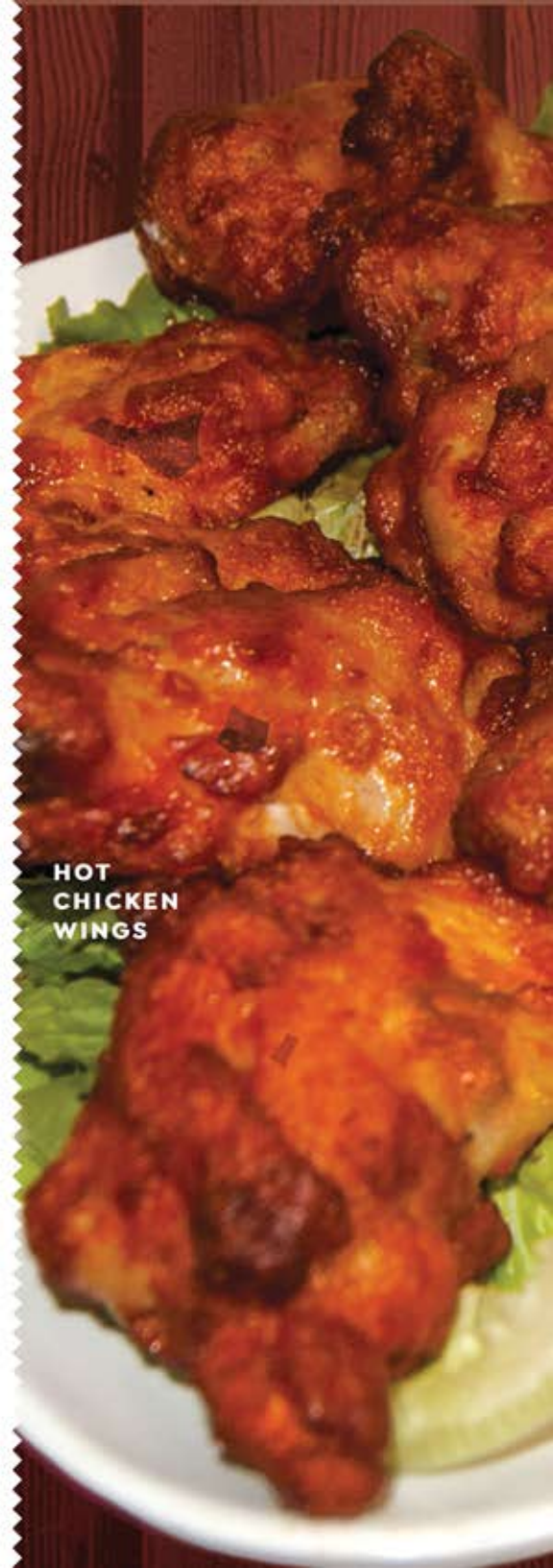
HOT CHICKEN WINGS