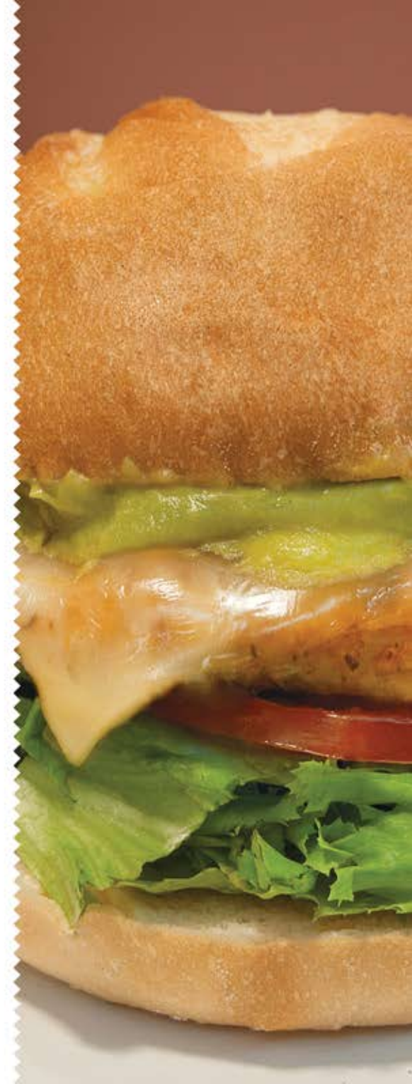
CALIFORNIA GRILLED CHICKEN SANDWICH